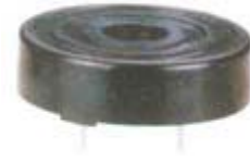
ABS Housing Material, Black

Various office equipment, computer peripherals, home appliances