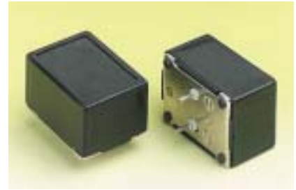
ABS Housing Material Color: Black

Alarm clock, timer, burglar and fire alarm, portable battery operated equipment, electronic cash register, automobile electronics