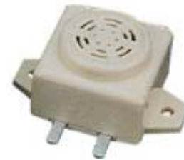
ABS Housing Material Color: White or Ivory