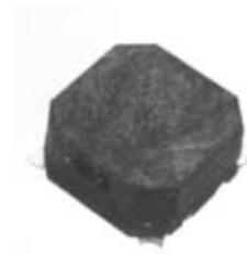
LCP Housing material, Black Color: Black